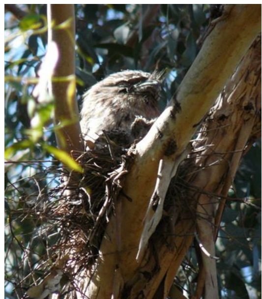
Tawny Frogmouth on nest